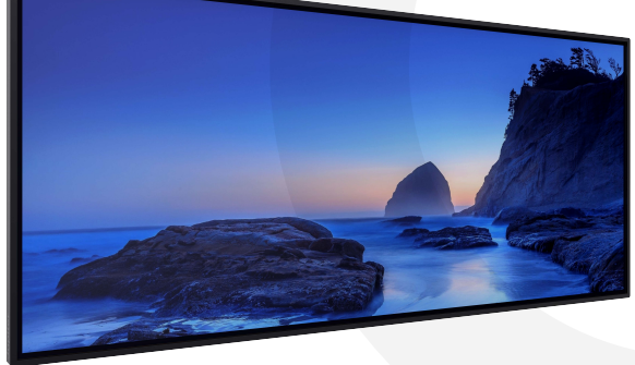
Jupiter's Pana 105T is the largest LCD display of the range